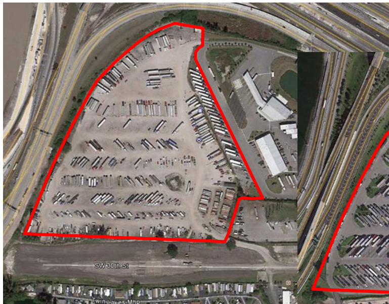
20 ACRE STORAGE FACILITY

CLIENT ADDRESS: 2705 Burriss Road Davie, Florida 33314